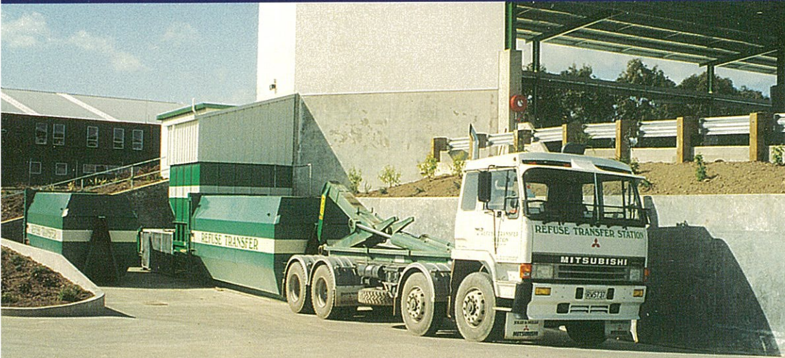
Huka RL200 ready to load a 25 cubic metre compaction bin, after being disconnected from the TS600 compactor, Palmerston North.

In 1992, Gary Temperton, well known landfill operator, decided to establish his own Refuse Transfer Station in