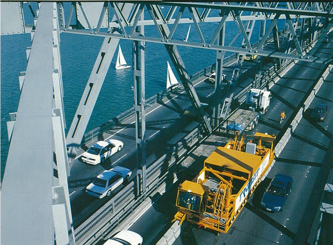
A Barrier transfer vehicle in operation, transferring the barrier across one lane during normal traffic flow.