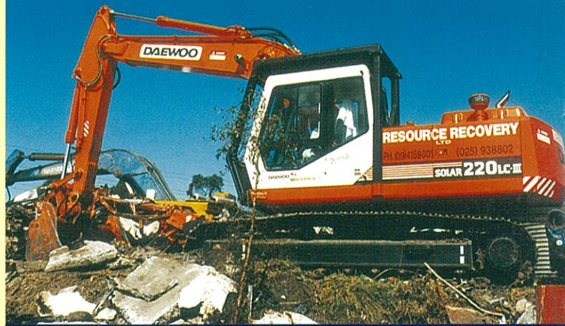
Resource recovery, one of New Zealand's leading recyclers utilizing the Daewoo 220 LC III with special purpose 4-in-1 bucket.

"After researching a number of hydraulic handling tools, I settled on the SS Multibite Bucket, built under license by Northland Steel Products. This is a 4 in 1 bucket. I also decided to remove the standard belly plates and replace them with 8mm plates and a 25mm central rotator protector plate, to protect against severe working conditions" says Kerry.