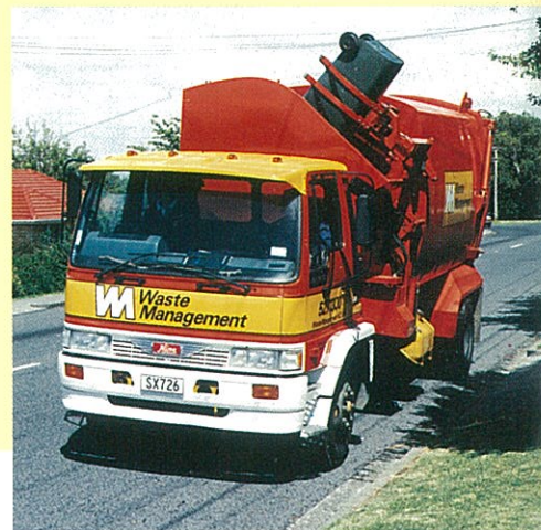
Manco SL60 Side Loading Arm and Manco 19 cubic metre compactor body in operation, Howick, Auckland.

The 19 cubic metre body sideloader is suitable for 4 x 2 trucks, with a legal payload of 6500 Kg. For longer haul distances, the 23 cubic metre body fitted to a 6 x 4 truck is available, achieving a legal payload of 10,000 Kg.