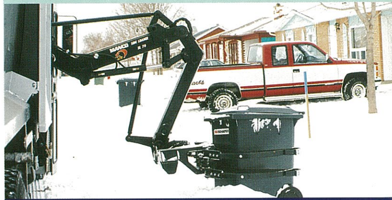
Manco SL70 side loading arm fitted to a Labrie Export 2000 23 cubic metre compaction body operating in Quebec, Canada.

Labrie Equipment of St Nicolas, of Quebec Province, Canada, are Canada's largest manufacturers of refuse and recycling vehicles, and are major suppliers in the total North American market. Although they manufacture side loading refuse vehicles, they have not previously been able to offer full automated side loaders.