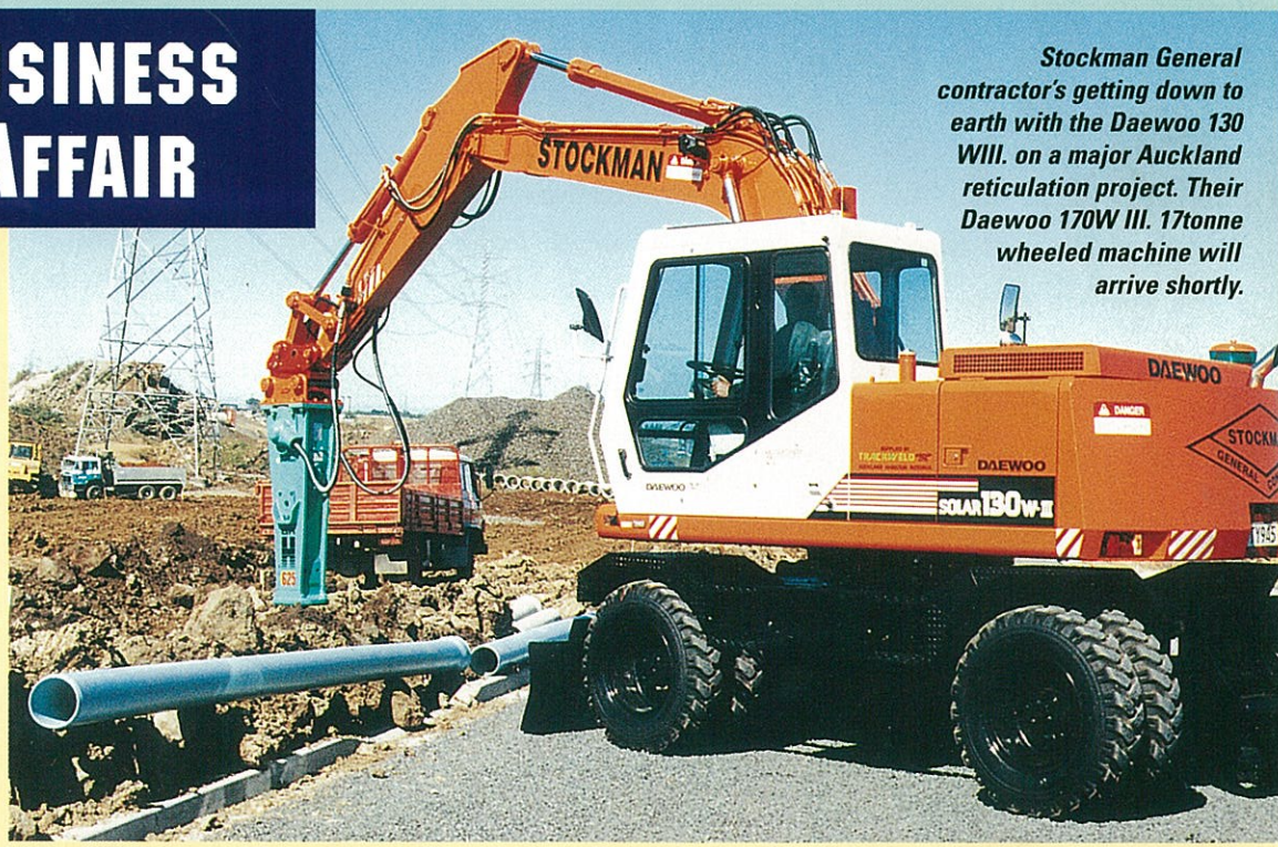
Stockman General contractor's getting down to earth with the Daewoo 130 Will. on a major Auckland reticulation project. Their Daewoo 170W III. 17tonne wheeled machine will arrive shortly.