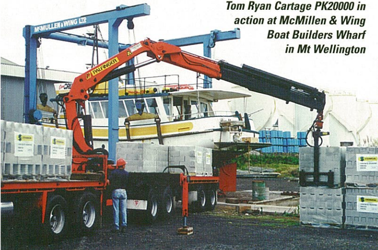
Tom Ryan Cartage PK20000 in action at McMillen & Wing Boat Builders Wharf in Mt Wellington

Based in Onehunga, Tom Ryan Cartage has been in business for 17 years. They purchased this Palfinger PK20000 from Manco 17 months ago to expand their fleet to 11 truck cranes.