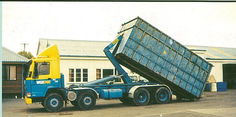
Huka RL 200 discharging recyclables at the recycling centre in Hamilton

Waste Care have been in business since 1968, originating as Industrial Waste Collections. Recently, they have become part of Browning Ferris Industries Limited, an international organization specialising in waste removal. Waste Care specialises in hard waste removal from commercial, residential and