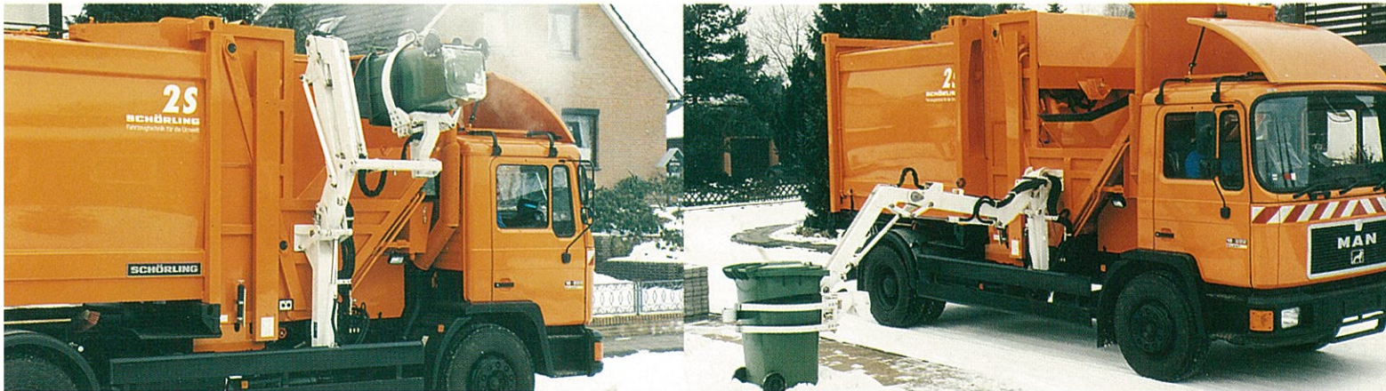
Schorling side-loading vehicle with Manco SL60 arm, working in Hauslingen, Germany.